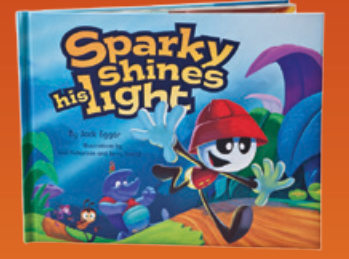
Thankfulness — Matthew 5:16

Buy your copy of Sparky Braves the Big Bees today at awana.org/store