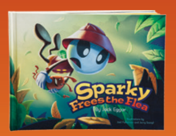
Obedience — Ephesians 6:1