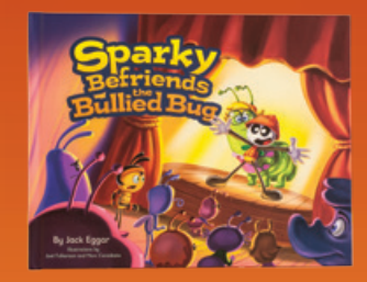
Kindness -- 1 Samuel 16:7

Build your library! Also available at awana.org/store